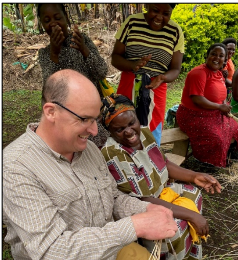
We encourage Guild members to take at least one of the wonderful waxed linen twining special classes being taught by Cael Chappell in February [See Pg. 8]