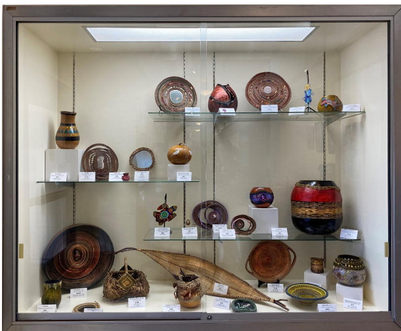
Exhibit at Encinitas Community Center January 11 - May 7, 2024.

Polly Giacchina's work was featured in the weekly Contemporary Basketry email distributed 12/29/23 and can be seen at: https://pollyjgfiberart.com/image-gallery/ .