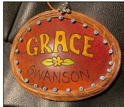
Example of April Mini-Workshop

A Zoom option will be available to members not able to attend in person (excludes mini-workshop).